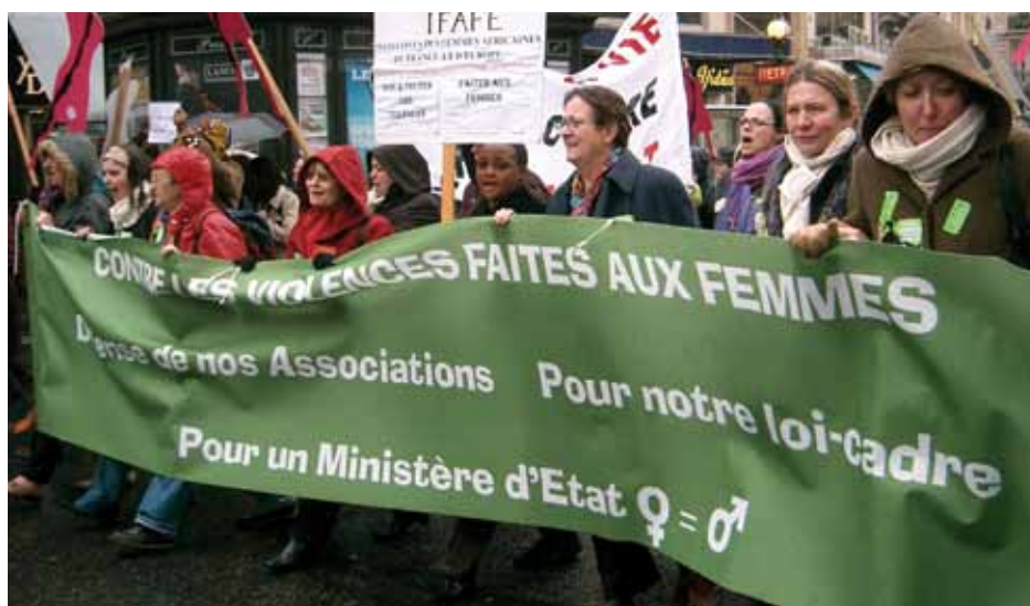
Demonstration to stop violence against women, Paris, 2007

In the late 1970s, after a struggle, the Women's Movement succeeded in securing the legal right to contraception and abortion. Feminists then began a new campaign – to stop violence against women. The Women's Movement developed political arguments against sexual violence. These forms of violence were seen as a means for the patriarchy to maintain control over women. Open debate of these issues was encouraged. Some new associations – in which members of MFPF got involved – were set up in the 1980s specifically to work on rape and domestic violence. It was in this context that MFPF decided, more systematically, to inform and to train its members regarding the issues of violence against women and formed partnerships with specialist organisations looking after victims.