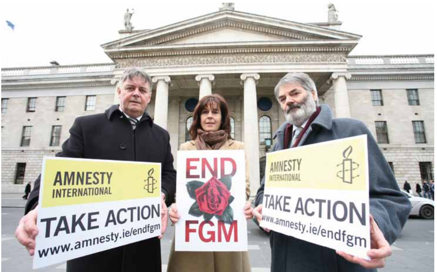
European Parliament candidates at campaign launch / © Amnesty International — Dublin candidates for the European Parliament elections 2009 Eoin Ryan, Senator Deirdre de Burca and Proinsias de Rossa (Left to Right) show their support for the END FGM European Campaign in Dublin city centre in advance of International Women's Day on 6 March 2009

by the European Parliament, WHO and professional organisations such as the International Federation of Gynaecology and Obstetrics but also illegal in certain countries in Europe.