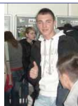
Educational workshop

The second phase of this twelve-month project consisted in school activities designed to confront rigid norms of masculinity and violence as well as in the implementation of educational workshops covering such topics as gender-based violence; emotions and conflict resolution; fatherhood and gender roles; sexual health and HIV/AIDS.