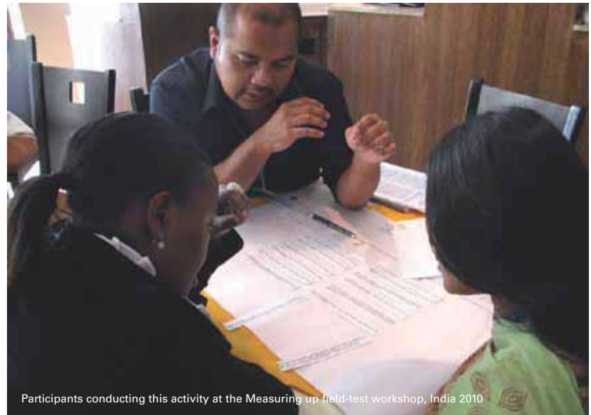
Participants conducting this activity at the Measuring up field-test workshop, India 2010