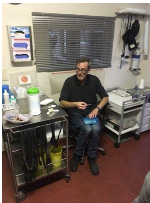
Additionally, outreach workers distributed 42,691 syringes and needles and 9,769 condoms in this time period.