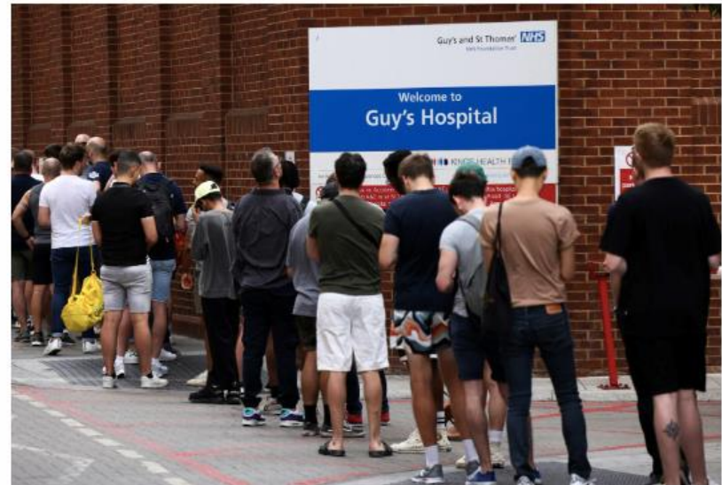
Lengthy queues outside vaccine clinics await those trying to secure a monkeypox vaccine.