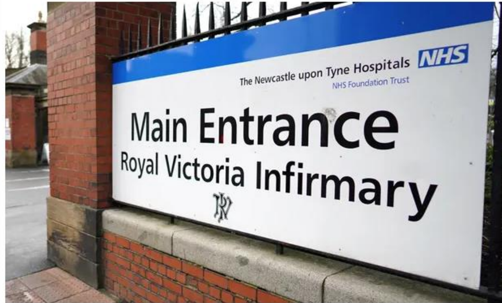
📷 Patients are being treated at hospitals including the Royal Victoria infirmary in Newcastle upon Tyne.