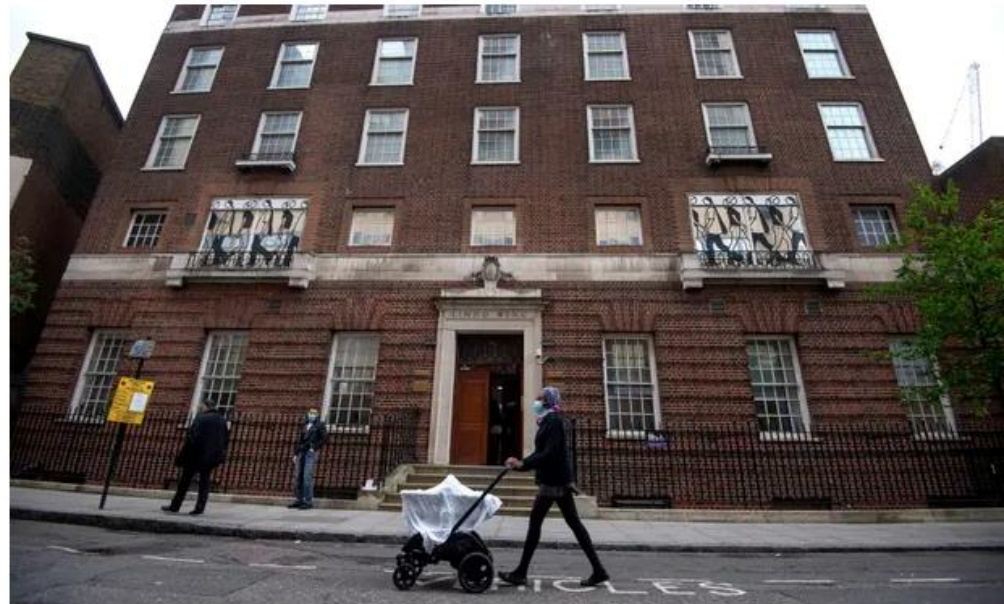
St Mary's hospital in London, where one of the two people diagnosed with monkeypox is being treated.